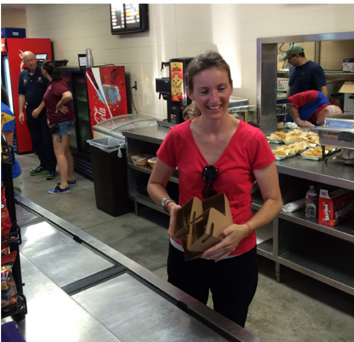
Friday Knight Lights