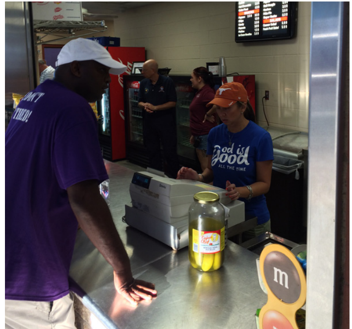
Friday Knight Lights