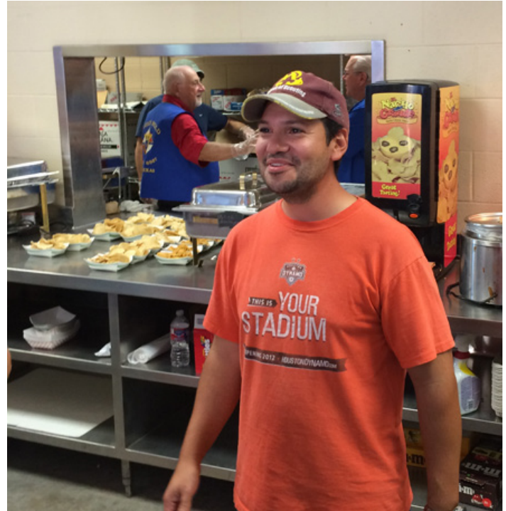
Friday Knight Lights